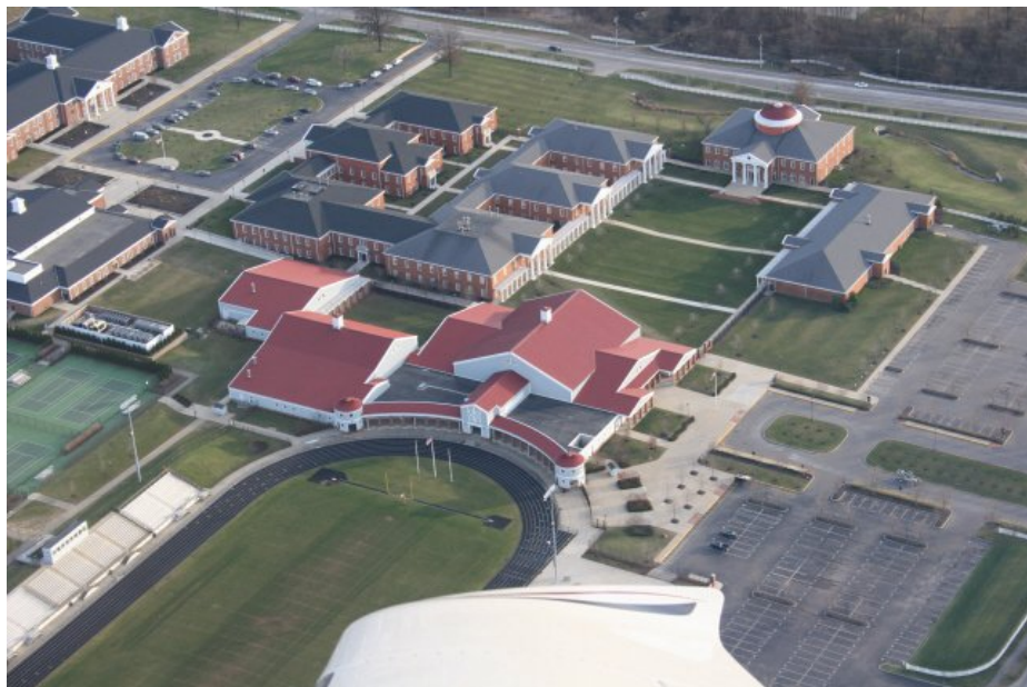
Modern Day New Albany-Plain Local Schools Campus

New Albany-Plain Local Schools 55 North High Street New Albany, OH 43054